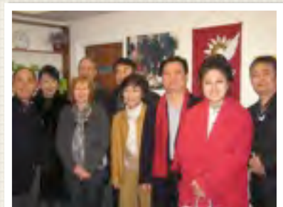
SOME KOREAN VISITORS