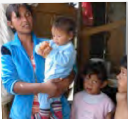
A YOUNG ROMA FAMILY IN KOSOVA

In early May we again travel to Kosova & Albania with a volunteer team of mixed ages & gifts. Like many parts of the world there is much hopelessness & we want to help by bringing The Gospel message on our recordings. In conjunction with the local churches we also distribute humanitarian aid & visit many poor families. Here in Kosova most are Muslim & like many