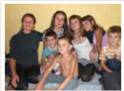
A NEEDY FAMILY IN KOSOVA