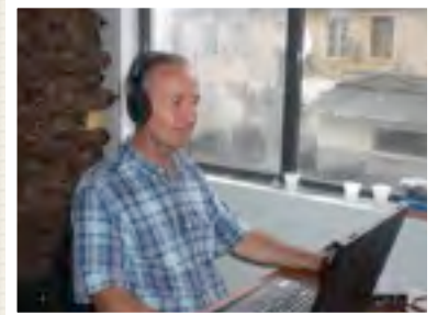
RECORDING IN ALBANIA