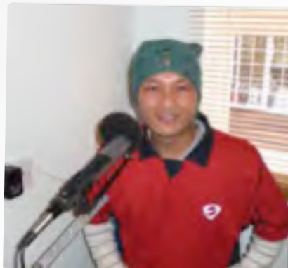
RECORDING IN THE "THADOU KUKI" LANGUAGE