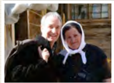
A WIDOW IN ALBANIA