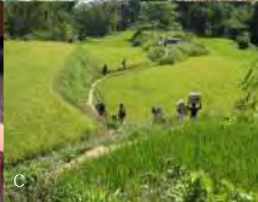
The Village (a) , people (b), the trail with luggage each volunteer (c).