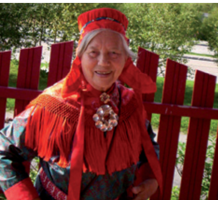
National costume of Sami (see article on p.3: 'A journey to the Northern Cape')