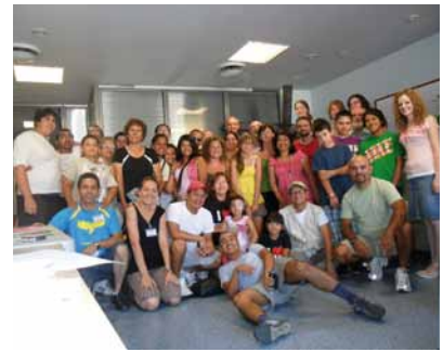
The entire team in Madrid

Please pray for those who have received the CD's and for those with whom we have had more profound contacts.