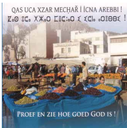
DVD for Moroccans