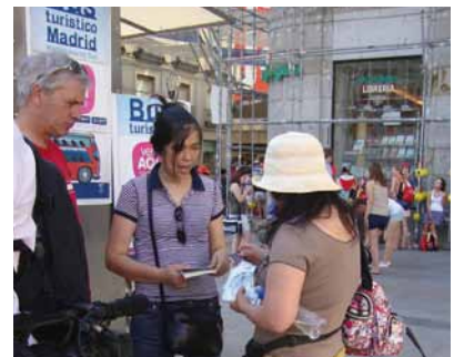
CD's being distributed in Madrid